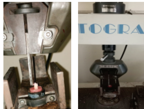
Figure 1: Mounted samples in universal testing machine

Following that, all samples were kept in distilled water at room temperature for one day. Specimens were mounted on universal testing machine (AG-IS Shimadzu Japan) as shown in figure 1. Composite cylinder was located transversal and the shear blade was positioned perpendicular to the tooth restoration juncture. Force was applied at a cross head speed of 0.5mm/min. Each sample was loaded till it broke and shear forces were documented directly from computer software in megapascal MPa